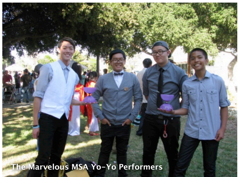
The Marvelous MSA Yo-Yo Performers