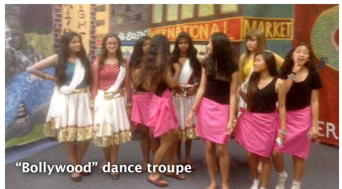
"Bollywood" dance troupe