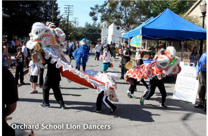
Orchard School Lion Dancers

As the bright moon ascended the night sky, traditional lion dancers led the huge crowd holding colorful animal lanterns paraded through the streets of the History Park. The moon smiled upon the History Park as the celebration of the Moon Festival ended with the last guests departing the park.