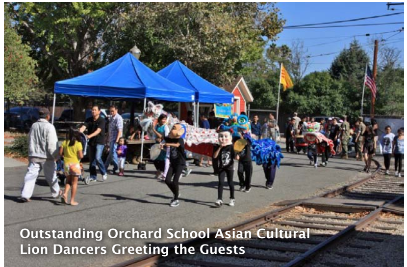
Outstanding Orchard School Asian Cultural Lion Dancers Greeting the Guests

A diverse slate of entertainment and performances delighted the audiences throughout the festival. The Orchard School Lion Dancers greeted the excited guests as they entered the festival.