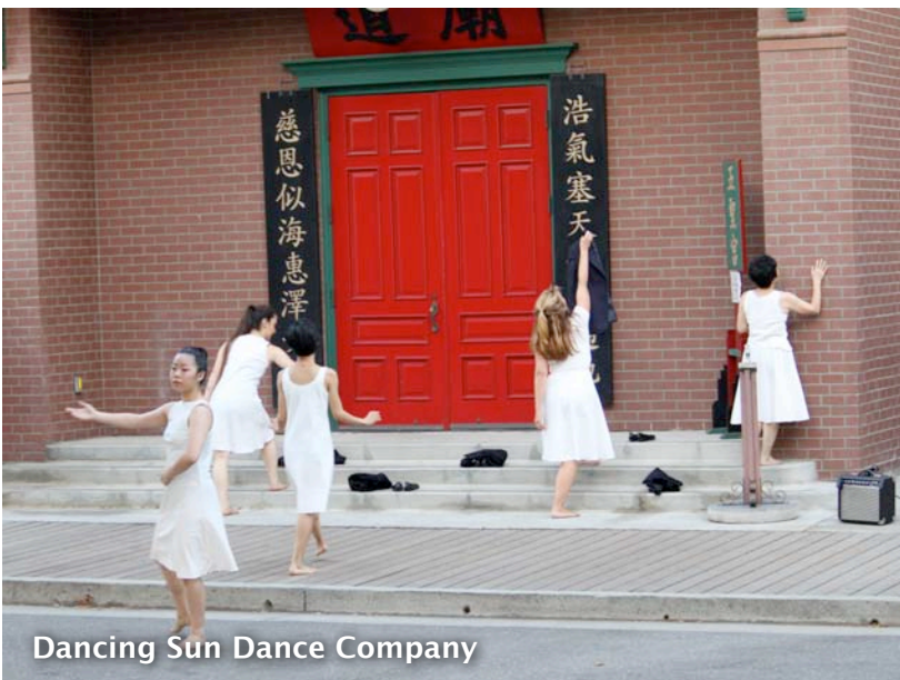
Dancing Sun Dance Company