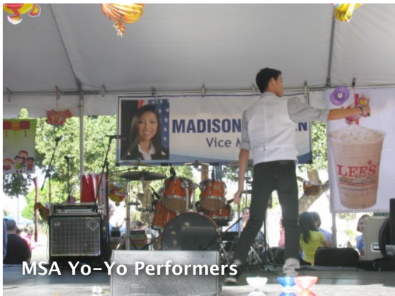
MSA Yo-Yo Performers