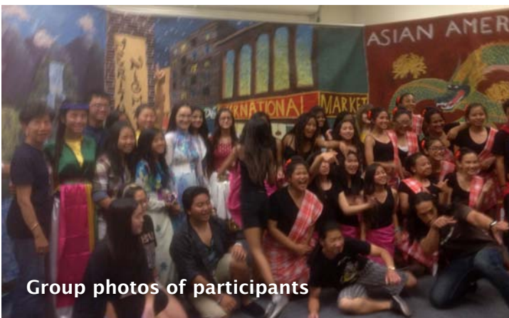
Group photos of participants