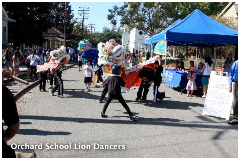
Orchard School Lion Dancers