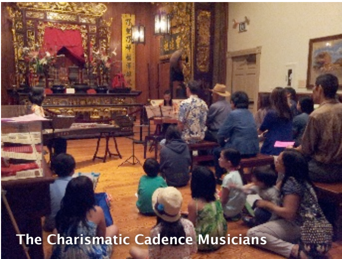
The Charismatic Cadence Musicians