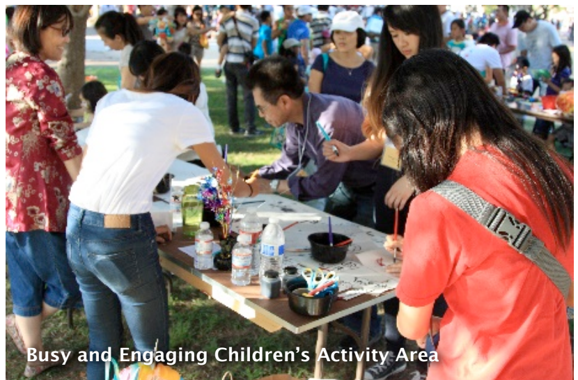
Busy and Engaging Children’s Activity Area