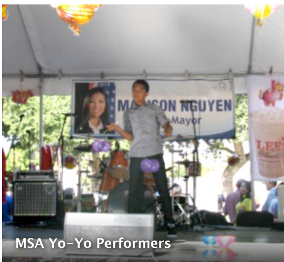
MSA Yo-Yo Performers