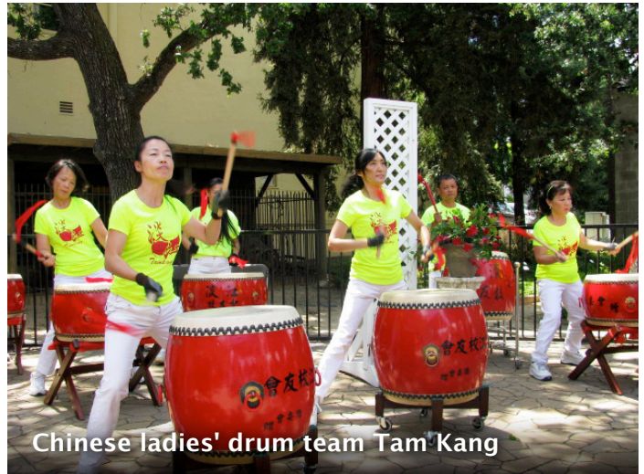
Chinese ladies' drum team Tam'Kang