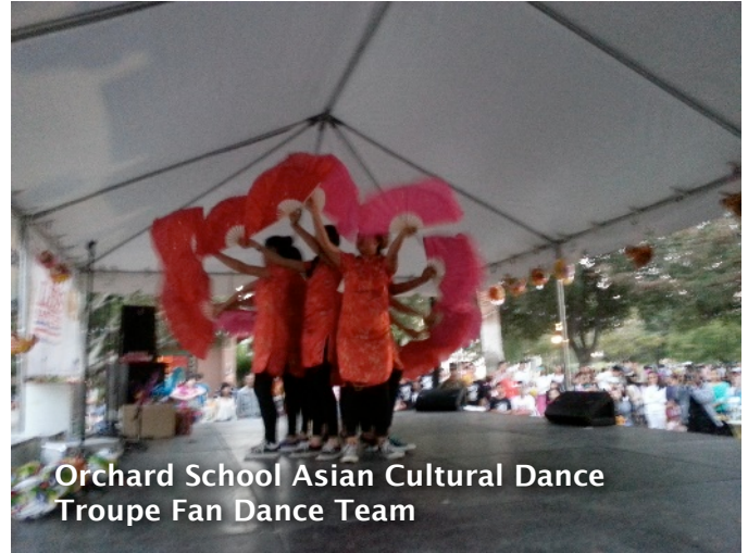
Orchard School Asian Cultural Dance Troupe Fan Dance Team