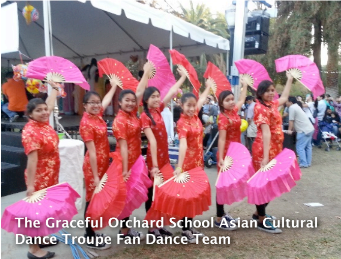
The Graceful Orchard School Asian Cultural Dance Troupe Fan Dance Team