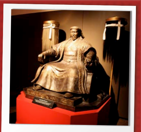
GENGHIS KHAN EXHIBITION