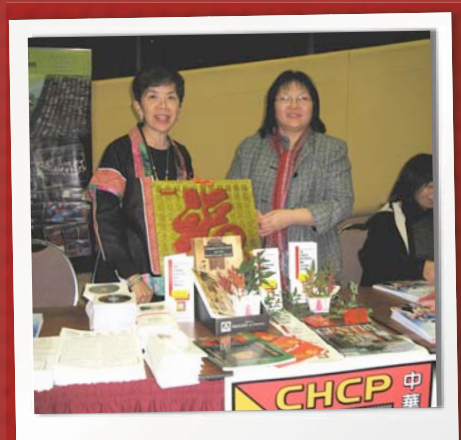
CHCP AT CPAA SPRING FESTIVAL