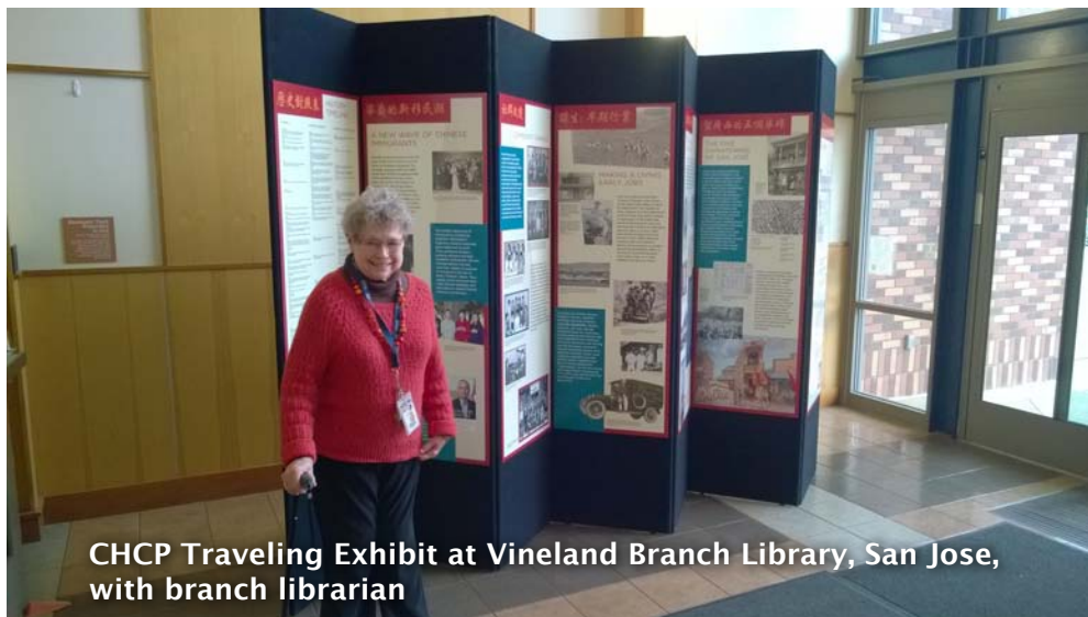
CHCP Traveling Exhibit at Vineland Branch Library, San Jose, with branch librarian

Finally, the exhibit was moved from Vineland Library to the entryway of the offices of the East Side Union High School District on May 6, just in time to be seen by new high school teachers at the district headquarters for training. It stayed at this location for the next month. At the end of June it will be out on exhibit again—this time at the Saratoga Historical Museum—for several months.